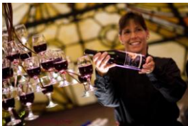
Signature Wine &